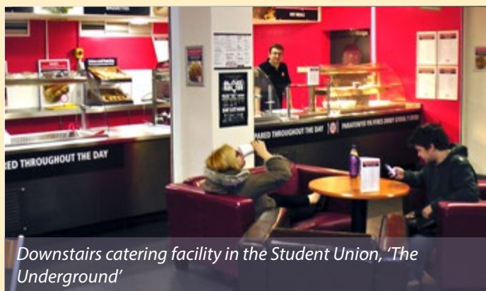
Downstairs catering facility in the Student Union, 'The Underground'

Moving forward through the semester, we've got lots coming up on the social calendar. We're busy gearing up for our annual May Ball on 9 May, taking over the campus with an evening bursting with live entertainment, split between the Students' Union and the Arts Centre. Open to both students and staff, we're sure there will be something for everyone on the night.