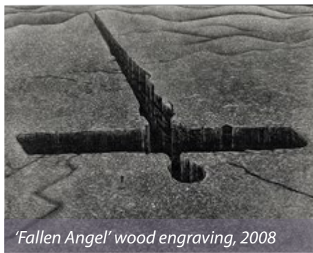
'Fallen Angel' wood engraving, 2008

This exhibition is a retrospective account of the career of one of the UK's most admired and prolific wood engravers.