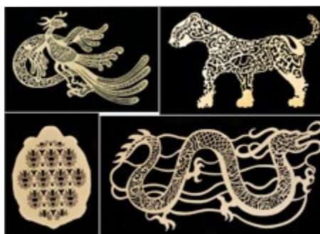
'Dragon, Phoenix, Turtle and Tiger', laser cut plywood

His PhD practice has provided him with the opportunity to continue this cross-cultural research and to combine it with his Middle Eastern heritage.