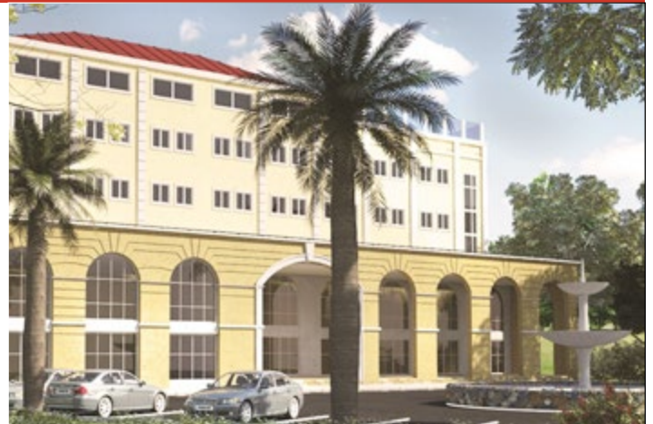
An artist's impression of the planned residential campus at Quartier Militaire

Under the arrangement, students studying at Aberystwyth University's Mauritius campus would enjoy the same status as their counterparts at Aberystwyth and upon successful completion of their course would receive Aberystwyth University degrees.