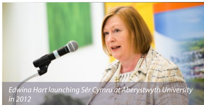
Edwina Hart launching Sêr Cymru at Aberystwyth University in 2012

www.aber.ac.uk/en/news/archive/2014/03/title-147529-en.html