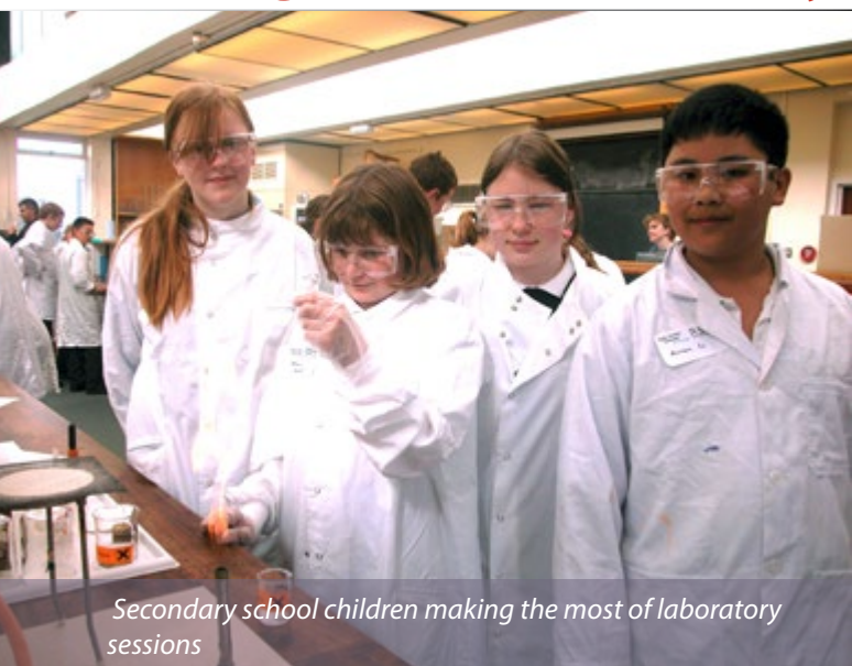
Secondary school children making the most of laboratory sessions

The University is calling on all secondary schools in Ceredigion to take advantage of a grant totalling £30,000 which enables students to directly engage with practising researchers in subjects including biology, chemistry, geography, politics, and sport and exercise science.